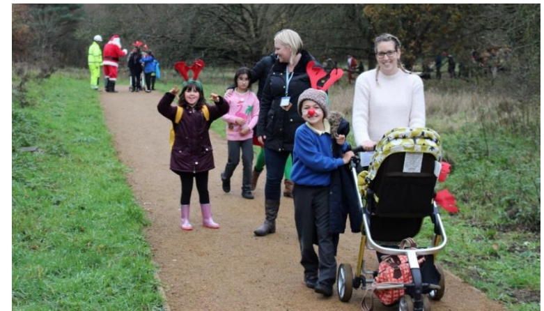
Pupils in the central SANGS with Santa Claus