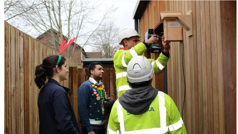
The bird box and feeder being installed

The motivation behind doing this work with Portesbery School was to raise awareness of the local environment, to teach our younger generations of the richness of their local biodiversity, and show them how accessible it is in an enjoyable and engaging way. Skanska has demonstrated that there are a number of interesting species, such as badgers, reptiles and invertebrates and given the school and it's pupils an understanding of the plans for enhancing the biodiversity of the wider area.