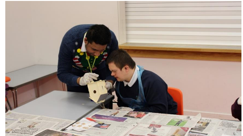
Pupils painting bird boxes with Skanska UK staff

On May 22 nd 2019, the teachers of Portesbery School were taken on an educational walk through the sites central SANGS, where the ecologist taught the teachers about the native wildlife and history of the site. The teachers that took part in this walk were thoroughly engaged and took away a new appreciation of the local wildlife, wishing to inspire their pupils with their new knowledge.