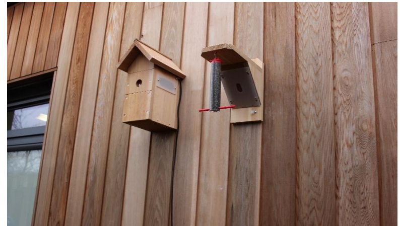
The new bird box and feeder.